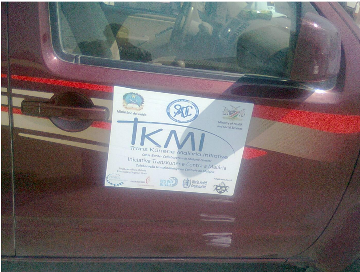
TKMI Vehicle Passage Logo/Car Sticker

A major achievement was the development of the TKMI Logo/Car Sticker which provides free passage for vehicles on TKMI duty/mission. The Logo was designed by Angola NMCP and a trial run was carried out during the TKMI meeting for transporting Namibia participants as they entered Angola. In Angola, the Malaria Health workers are already using it.