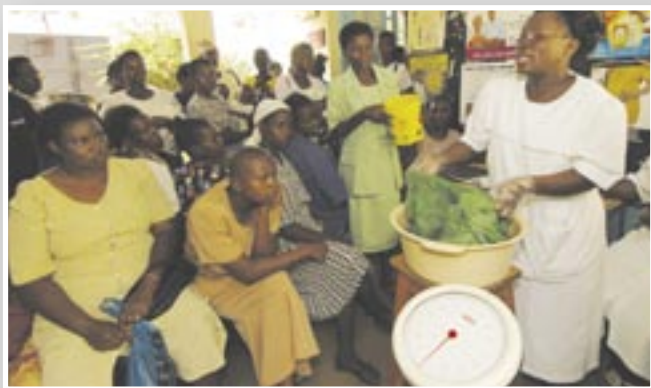
Clinic staff educate mothers on net treatment.

ITNs at a heavily subsidized price (US$0.60) through health facilities (antenatal clinics). People living in high risk rural areas may access ITNs for the subsidized price of US$1.20 through rural shops or NGOs, and those living in more prosperous urban centres may purchase nets in the commercial sector for about USD$4.