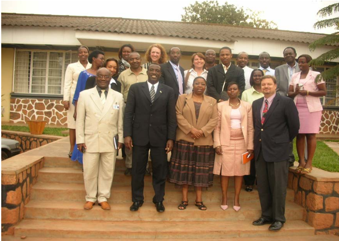
GROUP PHOTO: From left to right, the WHO resident representative, the Rwanda Ministry of Health, The Executive Secretary of RBM, the Coordinator of the Rwanda National Malaria Control Program and the USAID/Health Officer